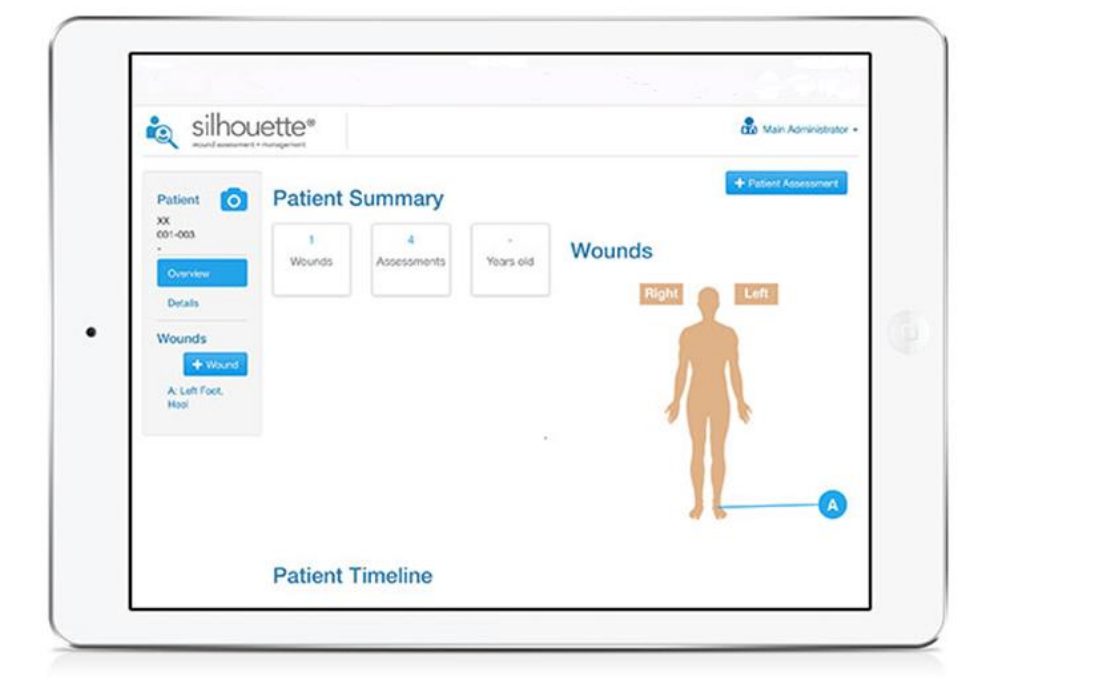
Figure 1. SilhouetteStar<sup>™</sup> wound camera